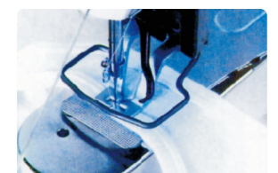
松紧带加固 Elastic reinforcement