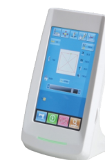
可选配Option 触摸屏 Touch screen